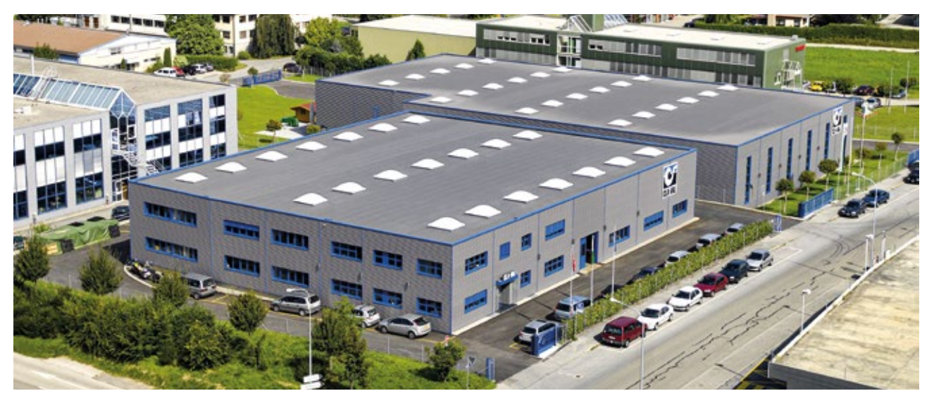
Lausanne, Switzerland - European Offices

With strategically located distribution centers and sales offices throughout the world, Cla-Val is the ideal source for superior technical know-how, unparalleled customer service and the finest quality products.